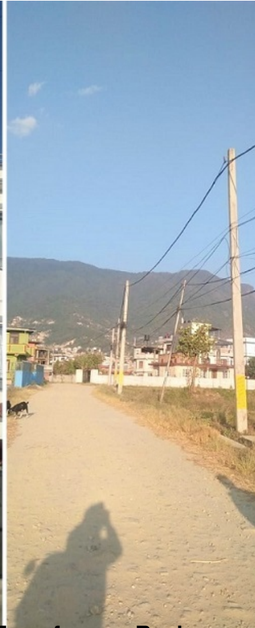
Upgradation of Distribution System Using Higher Capacity Distribution Transformer, Replacement of Old Ele