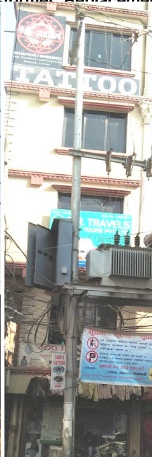
Upgradation of Distribution System Using Higher Capacity Transformer, Replacement of Old Ele